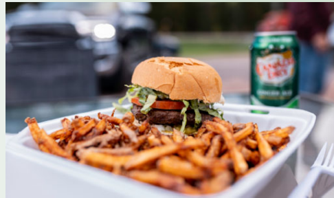
Dorion—Grill Shack Local beef sourced from Wolf River Farm