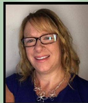
Business Development Officer